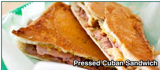
Pressed Cuban Sandwich