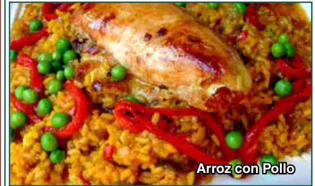
Arroz con Pollo

Arroz con Pollo* (Tue) 10.50 Saffron chicken & rice served with peas & roasted red peppers